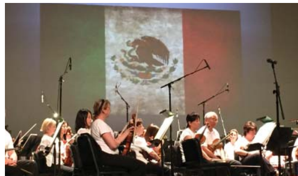
Musicians of the Houston Symphony getting ready to delight those present at Miller Outdoor Theatre for MIGH's XI LUNADA